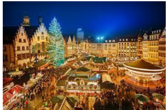
Frankfurt Market in Birmingham

Christmas markets are now big business across the western world. Continental Europe has led the way for many years with Budapest largely regarded as the leading example and Bavarian markets carry the crown for the typical chocolate box image. However UK markets now challenge both in terms of size and retail therapy. Here are some we have selected that are worth a visit in a Hilton Ames Land Jet along with the friends and Prosecco!