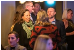
Party Goers enjoying the event