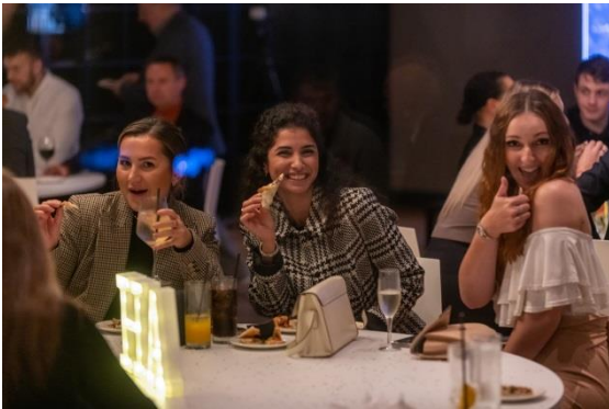
The events team from The Osborne Hotel in Torquay enjoying a moment in front of the cameras!