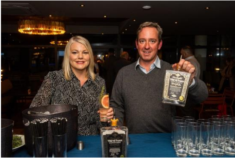
The Team from Trevethan getting the evening off with a flying start.