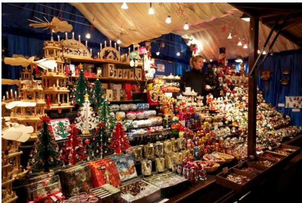
Leeds Christmas Market