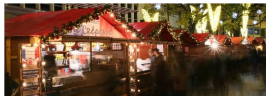
Bristol Christmas Market

Others worthy of mention are Winchester, Edinburgh, Lincoln, York and of course Exeter.